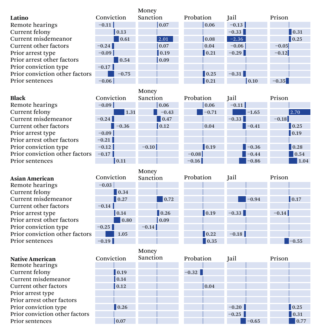
Figure 6. Factors That Explain Differences in Case Outcomes